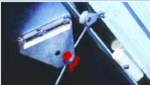
"Flip-Up" Bracket (Patented)