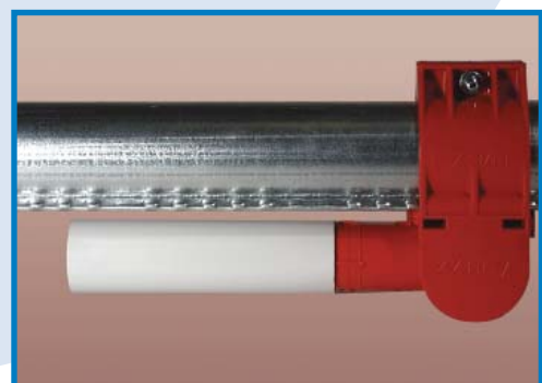
Telescoping white extension tube allows feeder adjustment to various pan heights.