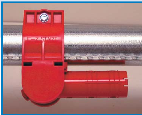
Permanently mounted outlet drop tube swings and locks under feeder line with built-in feed shut-off.