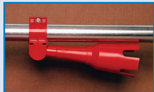
Telescoping Brood Cone stores neatly under the feeder tube.