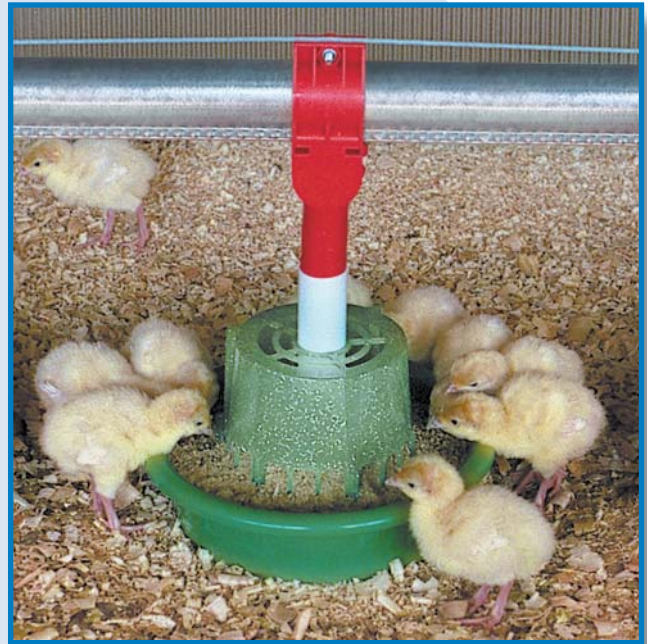
Low 2.5-inch (64 mm) pan height with deep "V" shape in bottom works together with feed cone to flow plenty of feed to bird eating area. Feed cone's patented sparkle flecks attract poults.