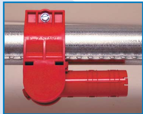
Outlet drop tube swings and locks under feeder line with built-in feed shut-off.