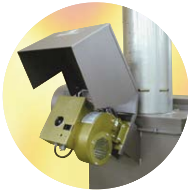
Model A200 Gas-Fired Burner Unit