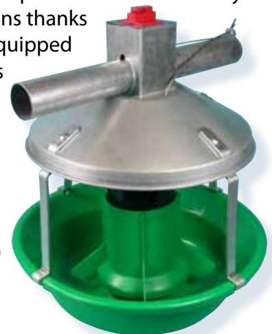
Chore-Time's MODEL ATF™ PLUS Feeder

Find your certified TRUE RED® distributor in our on-line distributor finder.