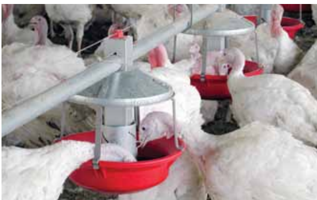
Chore-Time's MODEL ATF™ PLUS Feeder

Chore-Time's MODEL ATF™ PLUS Feeder retains all the reliability, ruggedness, and quality that the industry has come to appreciate about Chore-Time's famous Model ATF™ Feeder, PLUS even greater benefits for you: