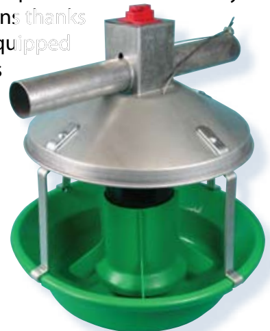
Chore-Time's MODEL ATF™ PLUS Feeder

Find your certified TRUE RED® distributor in our on-line distributor finder.