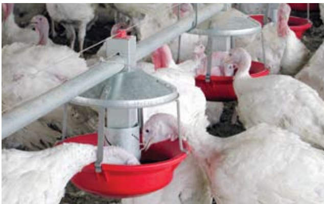
Chore-Time's MODEL ATF™ PLUS Feeder

Chore-Time's MODEL ATF™ PLUS Feeder retains all the reliability, ruggedness, and quality that the industry has come to appreciate about Chore-Time's famous Model ATF™ Feeder, PLUS even greater benefits for you: