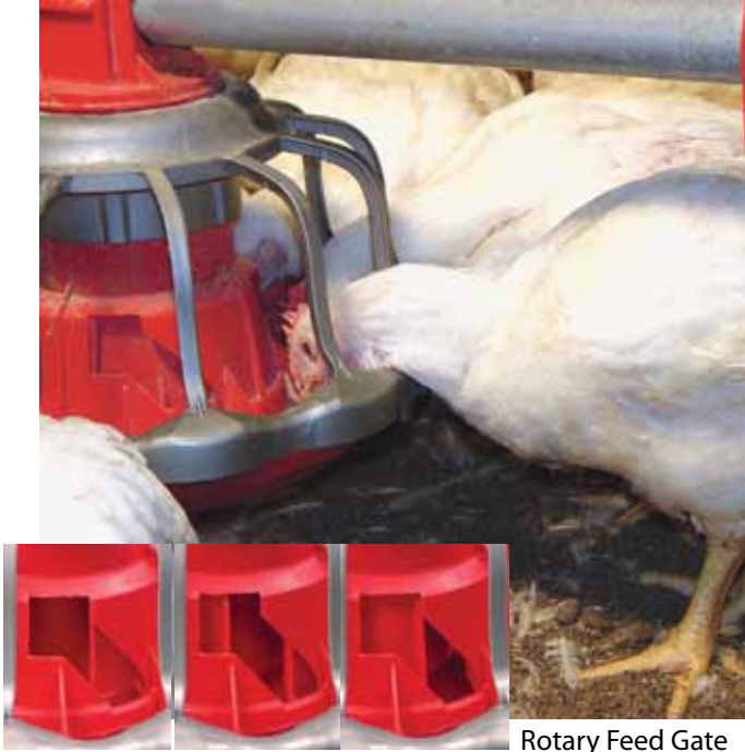
Rotary Feed Gate

Chore-Time's complete broiler feeding systems provide innovative design, proven performance and durability.