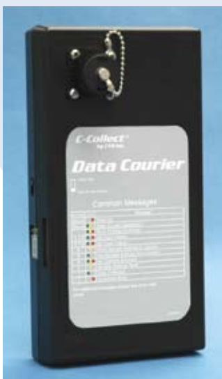
Handheld unit measures 4 x 7 x 1.3 inches and fits in a shirt pocket.

C-CENTRAL™ Professional Software is also available for remote setting and monitoring of your CHORE-TRONICS® Controls.